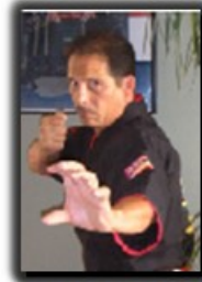
GM KIMO EMPERADO